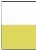
Half Page Horizontal: 7.75" x 4.875"